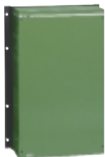
HT4520 TRANSCEIVER UNIT

Width: 440 mm Height: 635 mm Depth: 160 mm Weight: 16 kg