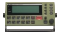
HC4500 CONTROL UNIT

Width: 200 mm Height: 100 mm Depth: 95 mm (incl. cables) Weight: 1 kg