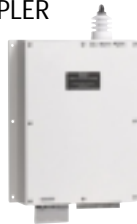
HA4525 AERIAL COUPLER

Width: 290 mm Height: 500 mm Depth: 80 mm Weight: 3.3 kg